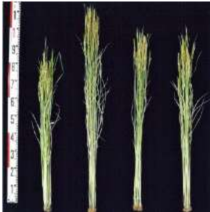
Image of Plant Variety