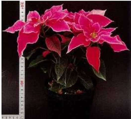
Image of Plant Variety