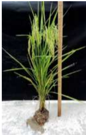
Image of Plant Variety