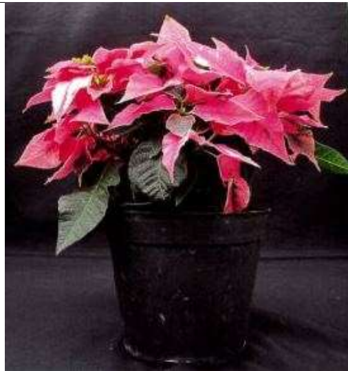
Image of Plant Variety