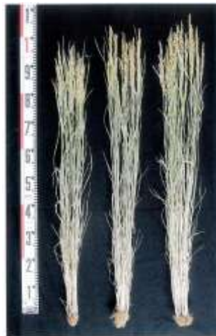
Image of Plant Variety