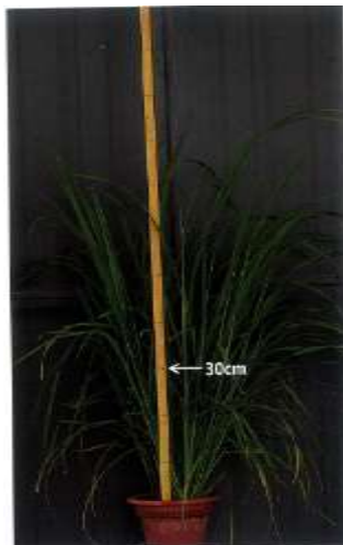
Image of Plant Variety