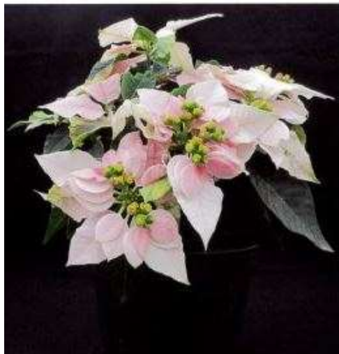
Image of Plant Variety