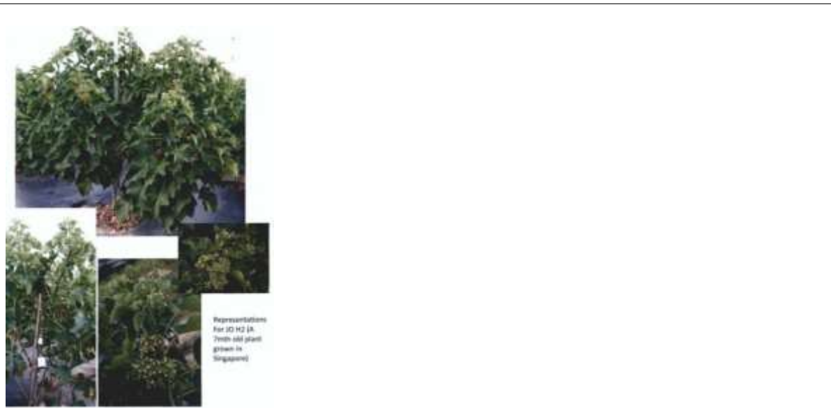
Image of Plant Variety