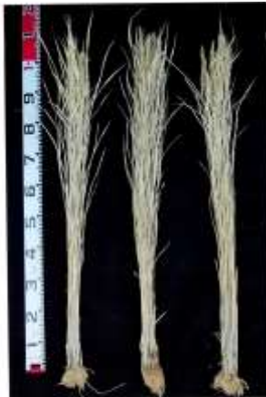
Image of Plant Variety