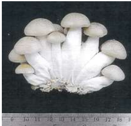
Image of Plant Variety